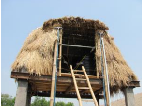
Dr B C Dutta

# Fill the Tank with 0.5% solution of Bleaching powder, keep it for 24 hours & then drain the Entire system